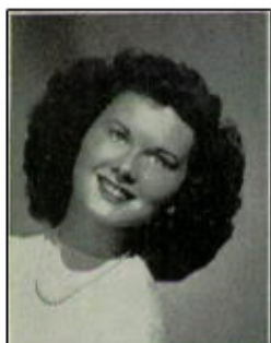
L.B. Wilson High 1947